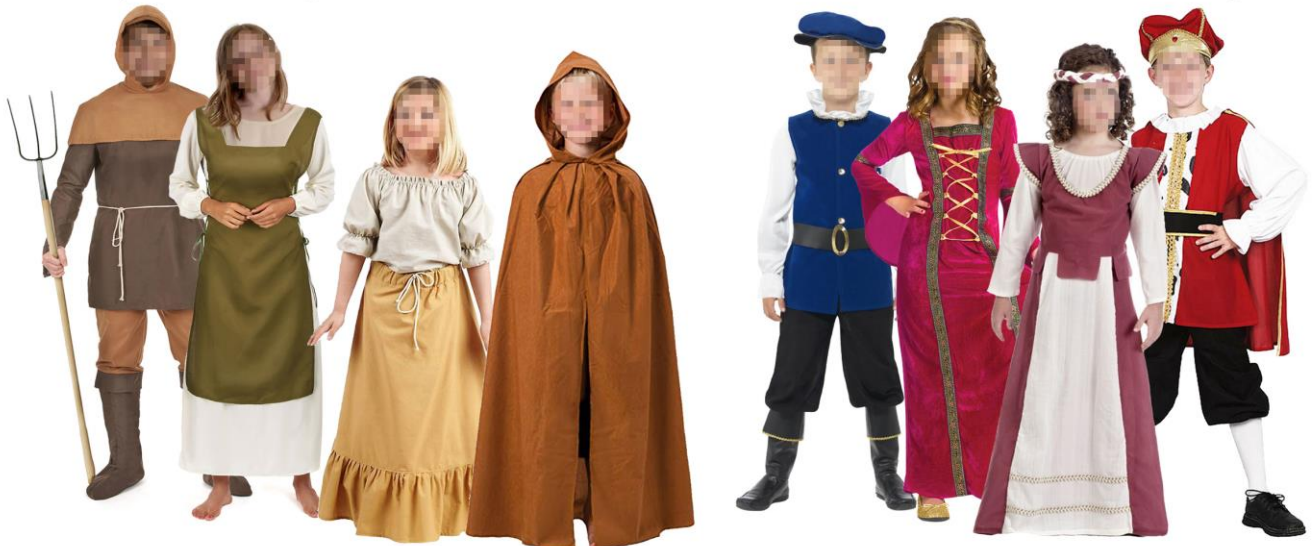
Farmers & Peasants