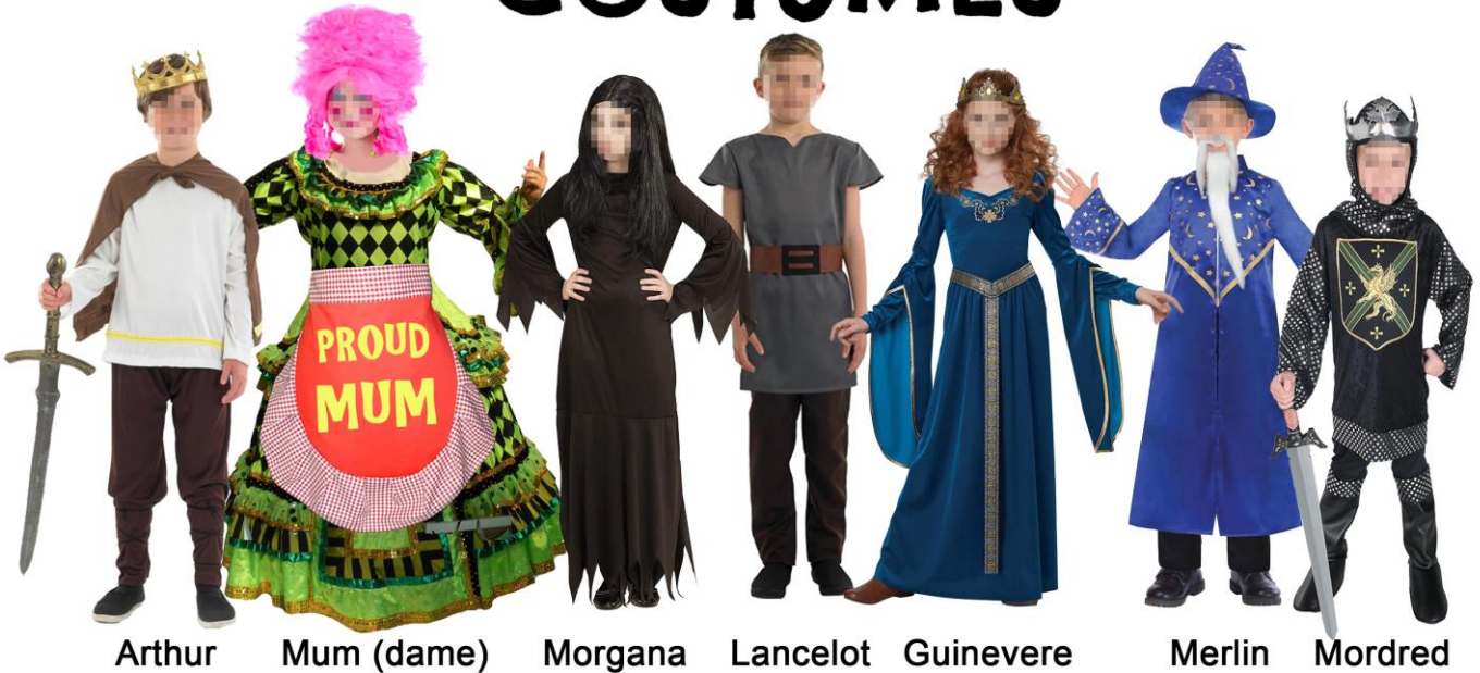
Arthur Mum (dame) Morgana Lancelot Guinevere Merlin Mordred