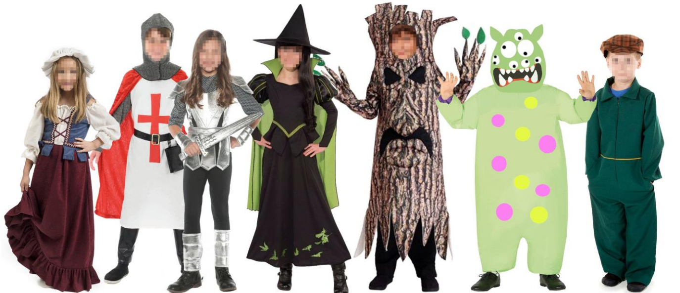
Gobby Knights Witches Trees Monsters Delivery Men